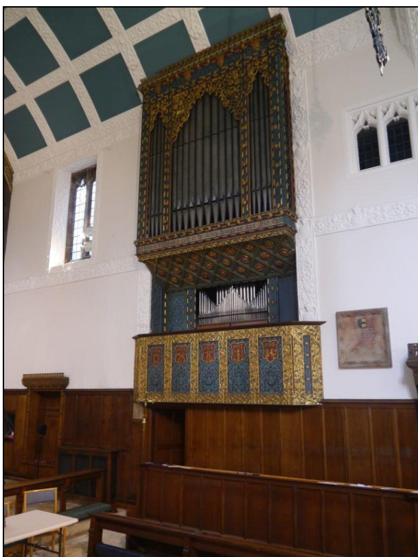
The Nicholson organ of St James' Hill, Mere Green