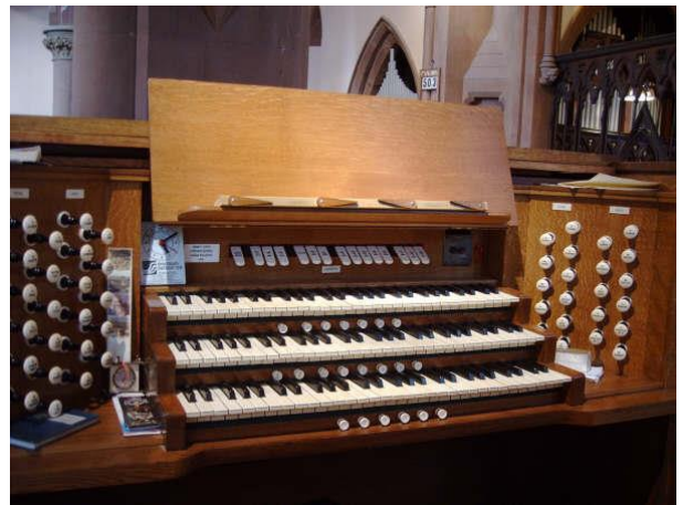
St Mark's Pensnett organ

Visit commencing at 2pm to St Mark's, Pensnett, known locally at the 'Cathedral of the Black Country', to play the 3 manual 45 stop organ overhauled in 1991 by Lloyd & Haynes.