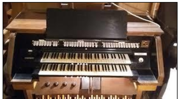
St Peter's, Cradley, Compton console

Then on for 3.30pm to St Peter's Cradley, by invitation of James Brookes, to play the 2 manual 31 stop Compton organ dating from 1933, which has recently been restored and brought back into full working order January 2018, after seven years of silence.