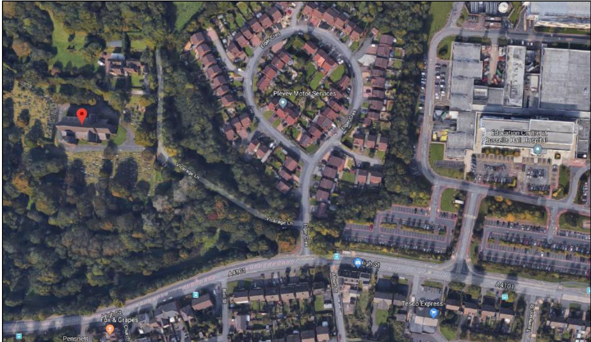
Locator map for St Mark's Pensnett (shown by red map pin)

St Marks' Church, Pensnett, Brierley Hill, West Midlands, DY5 4JH is located approximately 2 miles beyond Dudley, via the A4101 High St, past Russells Hall Hospital, then right into Elgar Cres and left into Vicarage Lane. Through the archway on the left into the churchyard for car parking.