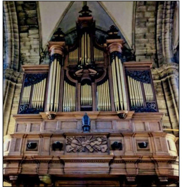
The organ of St Mary's, Warwick

Alfred E Davies/Nicholson Transept Organ, are both playable from the same console.