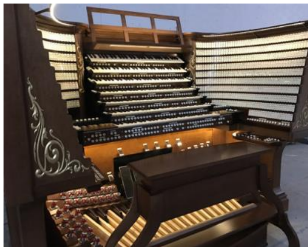
The seven manual hybrid organ planned for the Castro Theatre, San Francisco

The Wurlitzer organ, on loan to the theatre since the early 1980s, has been removed from the theatre. It will be replaced by an impressive custom-designed organ, now under construction, that will faithfully preserve the musical tradition of the Castro Wurlitzer and significantly expand it with 21st-century technology.