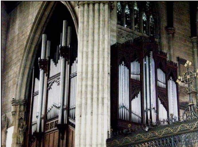
The organ of All Saints', Leamington Spa

Our visit commences at 11.30am to All Saints' Church Leamington Spa, and conveniently the church's café will remain open until 12.30pm.