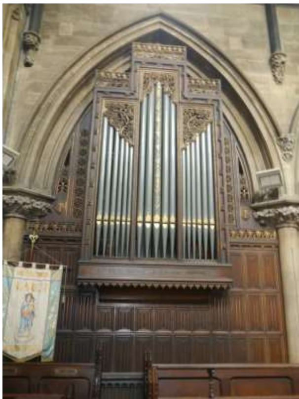
The G F Bodley chancel case of the organ of St Paul's, Burton-on-Trent

Acoustic Bass 32, Open Diapason 16, Bourdon 16 (Gt), Echo Bass 16, Octave 8 (ext), Flute 8 (ext), Trombone 16 (ext Gt), Fagotto 16 (Sw), Tromba 8 (Gt)