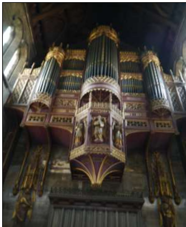
The G F Bodley case in the South Transept of St Paul's, Burton-on-Trent