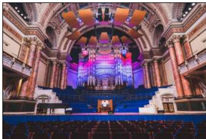
Leeds Town Hall organ