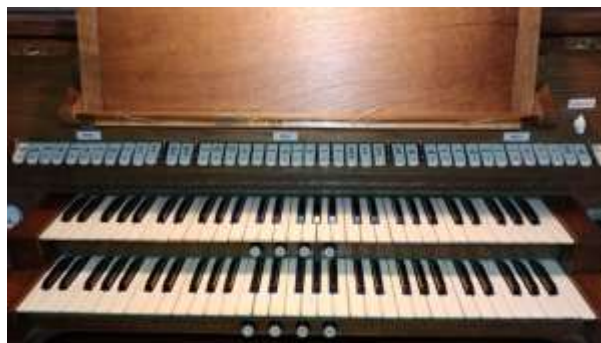
The console of the Conacher organ of St Paul's Burton-on-Trent