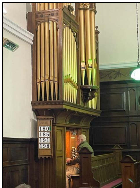
The Conacher organ of Shrewsbury Unitarian Church

The church was founded in 1662 and there is a memorial to church member Charles Darwin. Darwin's mother was the daughter of Josiah Wedgwood and the church has a beautiful frieze in a blue Wedgwood style. Another close relative in the family was Ralph Vaughan Williams.