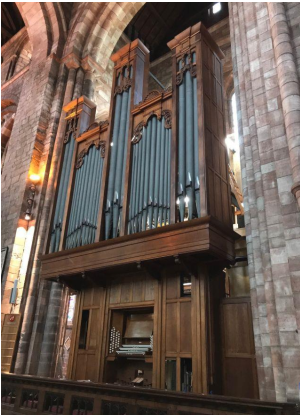
The Hill organ of Shrewsbury Abbey

The article covers his early life as part of a very musical family, in which his father was a good amateur cellist, his mother had been a concert pianist, and his grandfather Organist of Harris Manchester College Oxford for over 50 years, and his inspiration to learn the organ. The article goes on to his time as a chorister at New College Oxford, Lichfield Festival Director for a number of years, Senior Producer for BBC Radio 3 at Pebble Mill, and conductor of