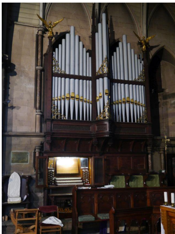
The organ of St Luke's Church, Derby