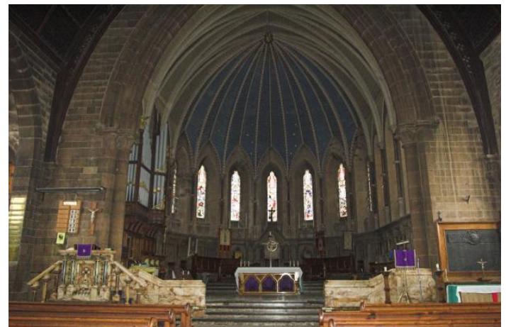
The East End chancel with high altar of St Luke's Church Derby, and with the organ just visible on the north side