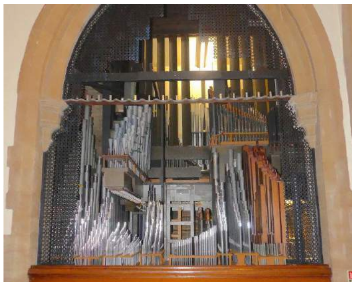
St Margaret's Olton before the front pipes were replaced