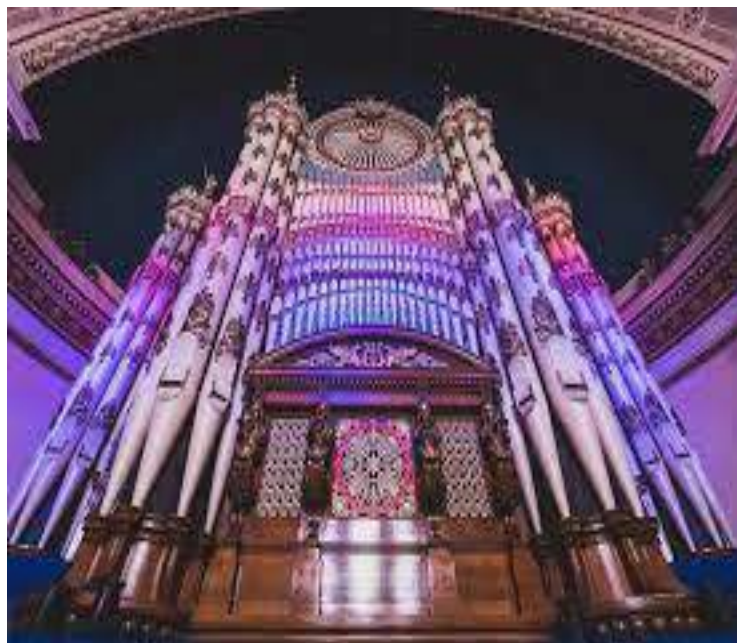
Leeds Town Hall