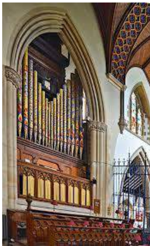
St. Michael’s Tenbury