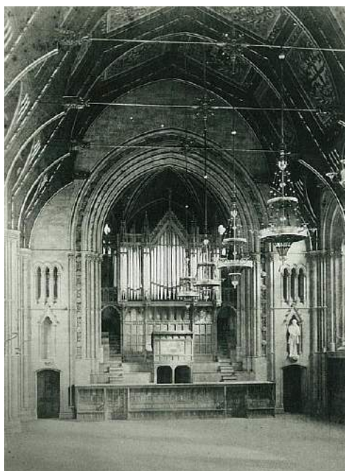
Manchester Town Hall