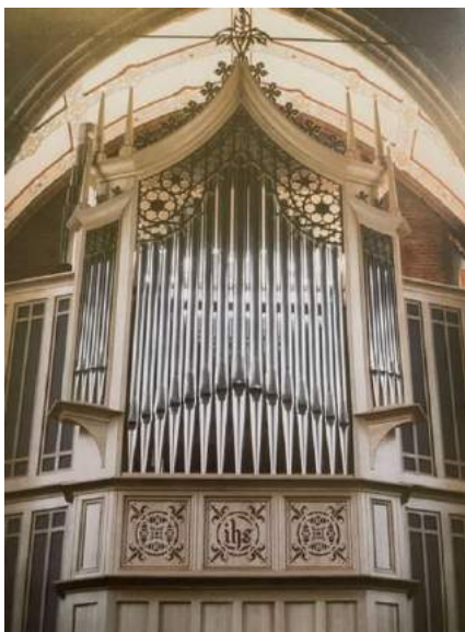
Emmanuel, Wylde Green

The instrument was purchased by Emmanuel Church and installed there in 2002. There is an Apse section of the organ behind the High Altar. Cleaning work is just being completed by the Willis firm. 3/59