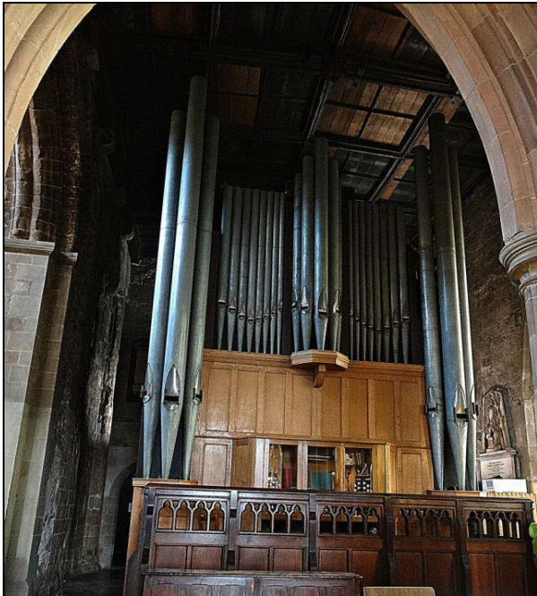
The historic Harrison organ of St Editha's, Tamworth