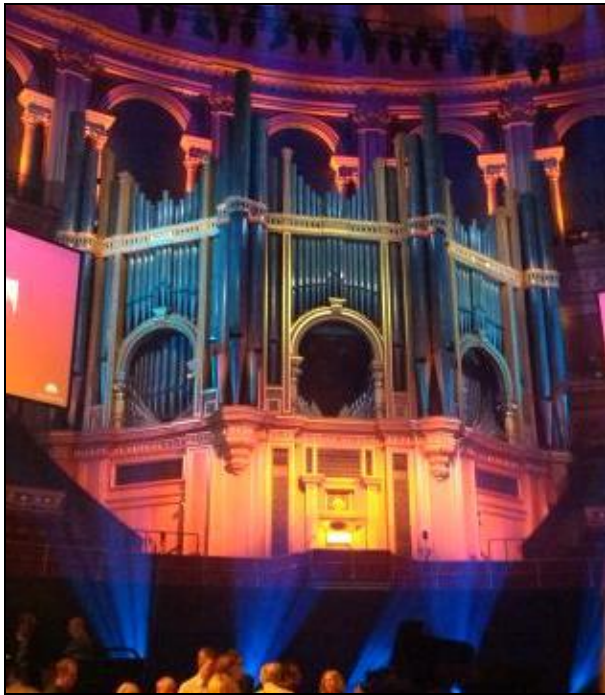
The Willis organ of the Royal Albert Hall

Olivier Latry then took over to play Mozart's Fantasia in F Minor, K608 , followed by Variations on a Theme by Paganini , George Thalben-Ball's challenging work predominantly for the pedals, and with both pieces of course played from memory! To take us to the interval, the other staple of the organ repertoire, Widor's Toccata from Symphony No 5 , was played by all three organists, swapping places seamlessly at the console!