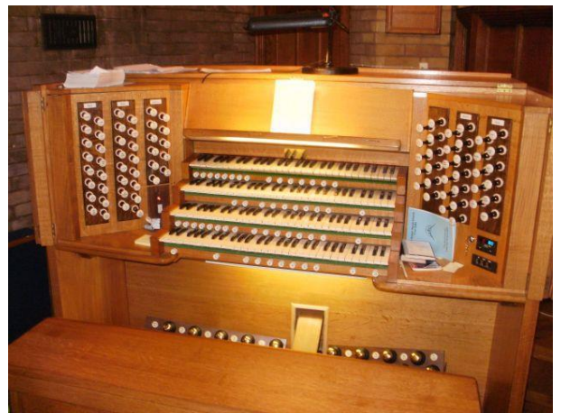
The organ console of All Saints' Four Oaks