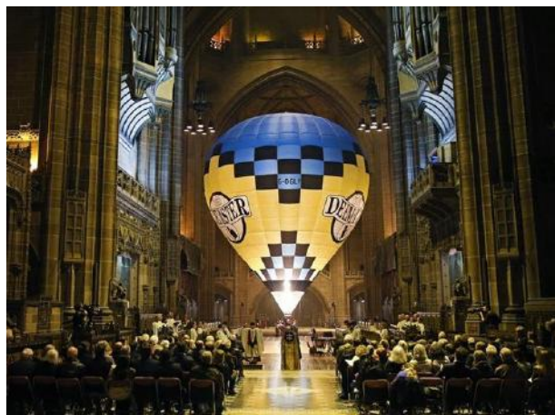
Hot air balloon being flown inside Liverpool Cathedral in November 2017