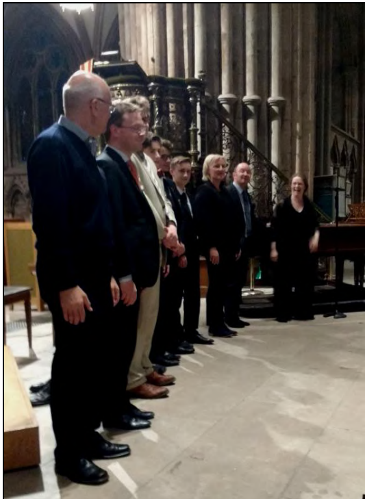
Organ Extravaganza performers receiving their applause