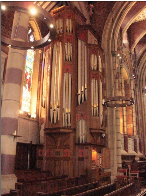
Rugby School Chapel’s magnificent organ