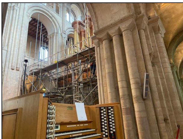
Scaffolding around the organ of Norwich Cathedral, with the Copeman Hart hire organ in the foreground

Now 75 years on from when the 4-manual/105-stop Norman & Beard organ was first restored, ciphers are an increasing mechanical problem. All the pipes need removing, cleaning and restoring, the mechanisms within the organ itself need renewing and modernising, the worn-out key action needs replacement, and the unreliable and outdated electronics of the console brought up to date. The project is expected to cost £1.8m, inclusive of a new chamber organ.