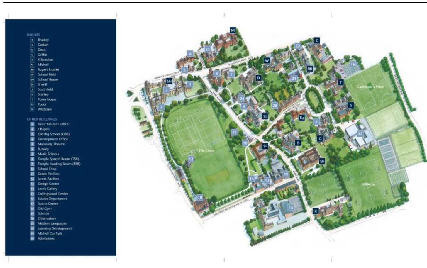
Map of Rugby School premises

Refreshments will be provided during the afternoon, and we have been specifically requested to draw the attention of members to the Rugby School Visitor Policy, so please take a look at: https://www.rugbyschool.co.uk/wp-content/uploads/2021/10/Safeguarding-Information-for-Visitors-2021-MASTER.pdf