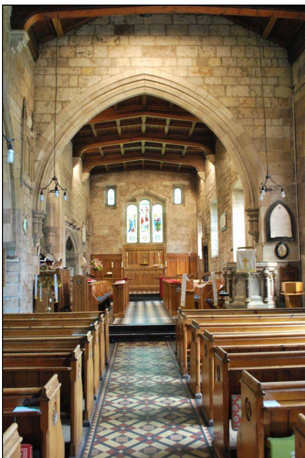
St Helen's Church, Etwell

I must admit to not having been to Etwell before, indeed I had to look it up - good job I did as had first assumed it was on the M6 towards Manchester - thank goodness for that map in our newsletter.