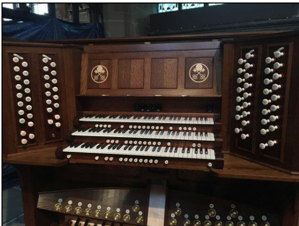
The new Renatus console of St Peter's, Wolverhampton