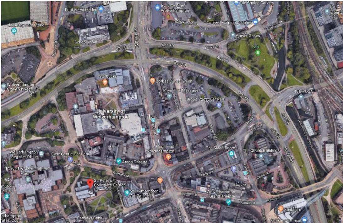
Locator map for St Peter's Wolverhampton (red map pin), with the Civic Centre Car Park slightly above and to the left, as marked.