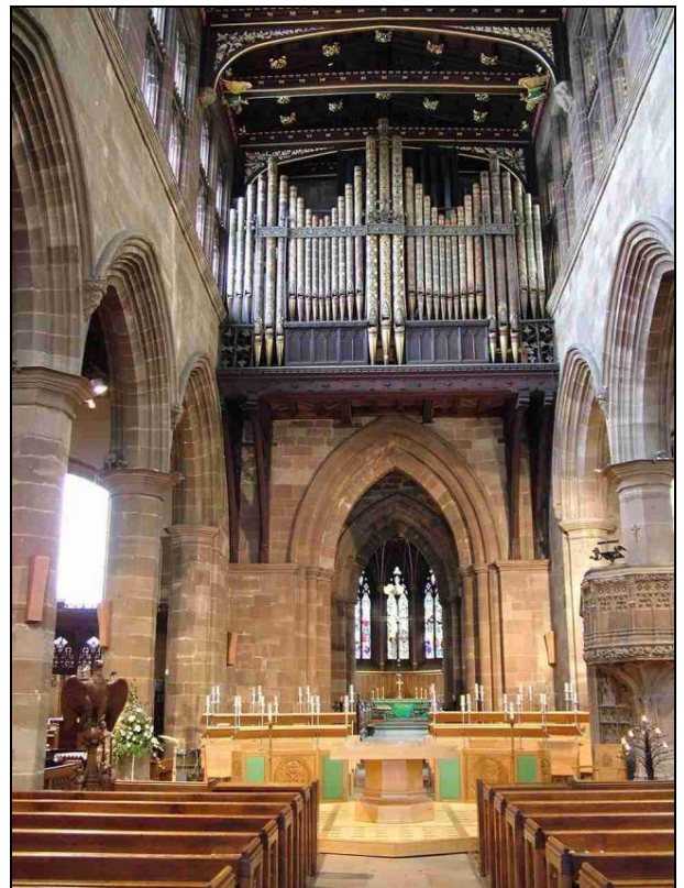
The Willis organ of St Peter's, Wolverhampton (2014)