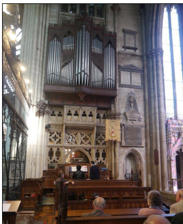
The chancel case of the organ of All Saints', Leamington Spa