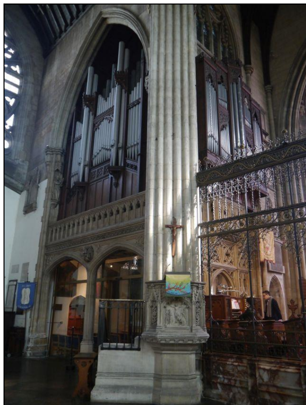
The Hill Norman & Beard organ of All Saints', Leamington Spa