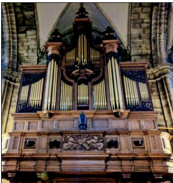
The Nicholson organ at the West End of St Mary's Warwick