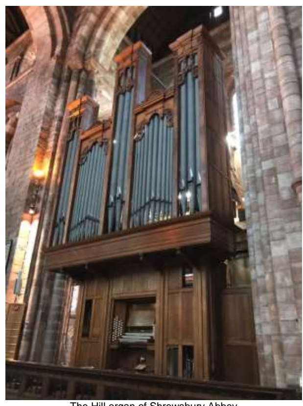
The Hill organ of Shrewsbury Abbey

This is the most significant work on the organ since its original installation, and after nearly 110 years, this scheme finally realises Hill's 1911 specification, with minimal change.