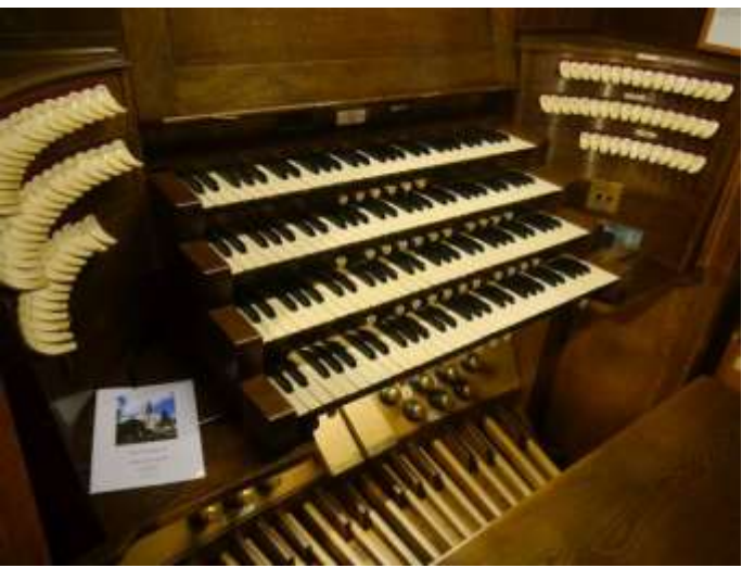
The four manual stop-tab console of St Matthew's, Walsall