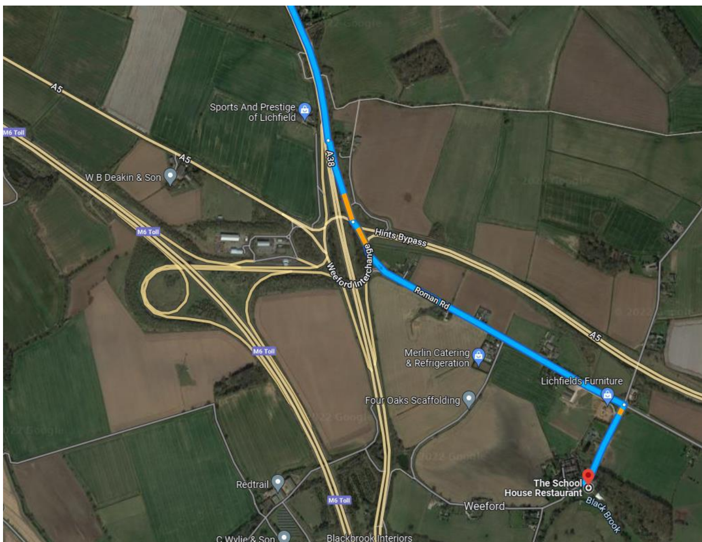
Locator map for the School House Restaurant, Weeford

The School House Restaurant is at Church Hill, Weeford, Lichfield, WS14 0PW. Referring to the locator map below, from the direction of Lichfield, take the A38 South, then take the slip road on the left towards A5 East. At the roundabout, take the second exit signposted Hints/Weeford, and continue along the Roman Road (Watling Street), then take the 2 nd road on the right down Church Hill to Weeford. The restaurant is just down the hill on the LH side, opposite the church.