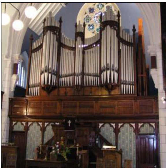
The Norman & Beard organ of Shrewsbury URC